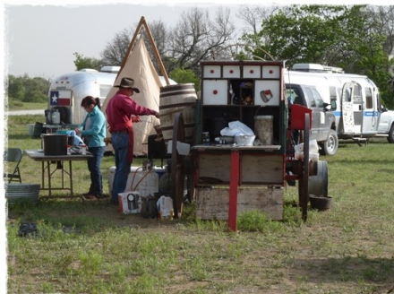
Lone Star Vintage Cam-