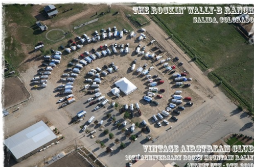
Rocky Mountain Vintage Airstream Rally