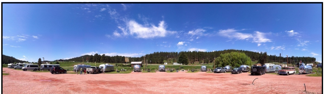
2013 VAC Wagon Wheel Caravan Hill City, South Dakota