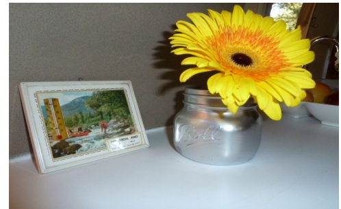
Janell Prussman, DenCo Unit, provided each trailer with a silver painted jar and flower for the Trailer Open House.