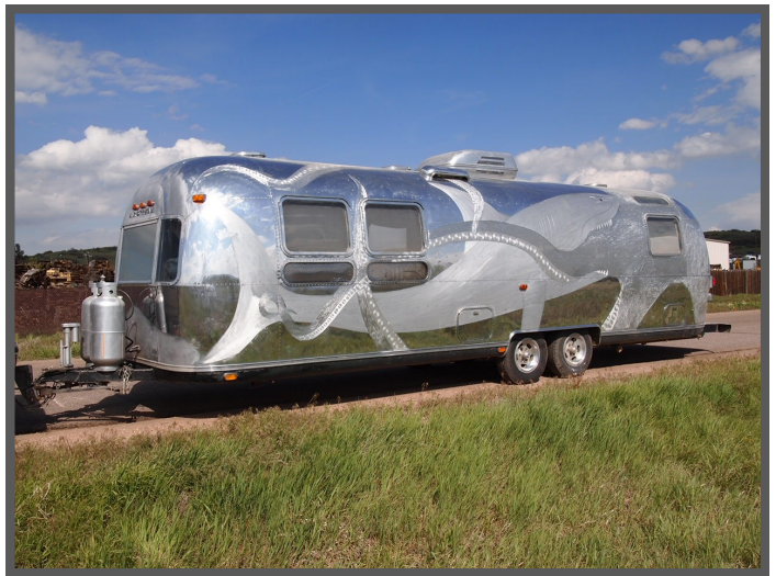
Shark Taking a Hefty Bite out of the same Octopus!