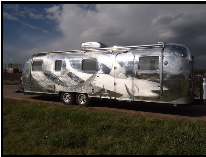
Giant Octopus Ensnarling a Shark!

It was our boat named " The Jolly Codgers " that inspired the design theme of pirates of the high seas. Using the line drawings from our Airstream manual and making copies we invited our families to submit designs for the outside of the trailer. The final design was a scene worthy of any tall tale from the high-seas -- a giant octopus ensnarling a shark on the star-board side, with another shark taking a hefty bite out of the same octopus on the port side.