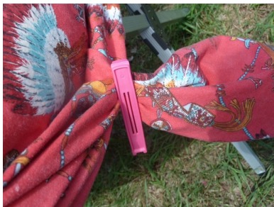
Lois Angerami, DenCo member, used colorful bag clips to wrap up the ends of a tablecloth to keep it from blowing away.