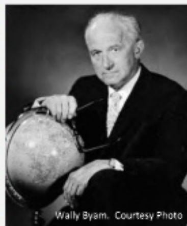
Wally Byam. Courtesy Photo

By Tom Scanlon with permission from The Daily Courier of Prescott, AZ, 01/18/2015