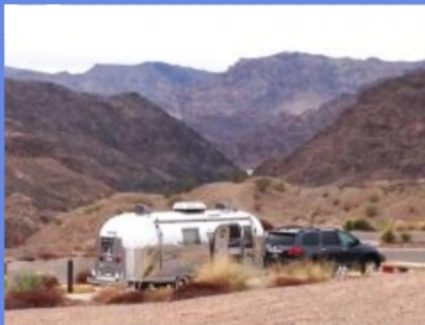
Melissa streaming to the southwest caravan with Norfal heading to Alumafiesta in Tucson.