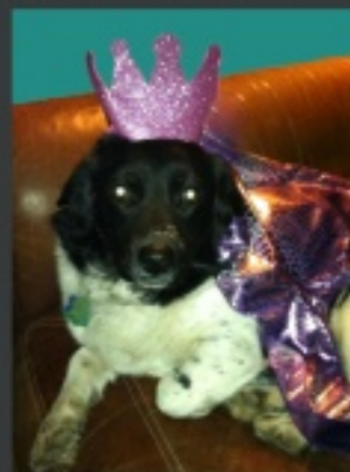
Our little princess, Stella, was all dolled up and ready to go but didn't quite make it. She passed away a couple days before the Rally.