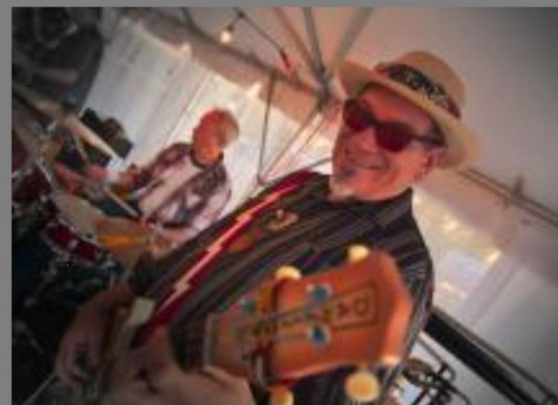
Memphis P-tails playing the Blues at a VAC Members only BBQ