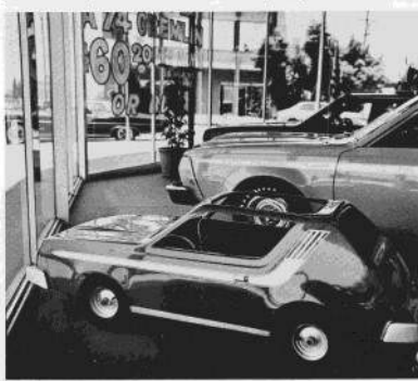
AIRSTREAM IN THE SHOWROOM—Airstream's Component Manufacturing Division manufactured this 1935 Graham automobile body on display in an American Motors showroom in Los Angeles. (See story on page 8)