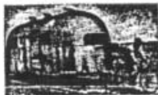
Our Old Friend "Alfred" Towed This 22 ft. Model On His Bicycle. 2 floor plans to choose from in this size.

Nothing short of war can stop us from building the world's finest trailercoaches — experience — constant engineering — ability — all go into these wonder Post-War Trailercoaches — COST MORE — WORTH MORE.