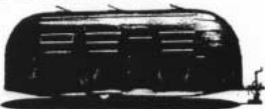
1949 22 FT. MODEL

when passing or being passed by buses or trucks as the Airstream Liner design keeps the vortex, or suction of the wind, to an ABSOLUTE MINIMUM.