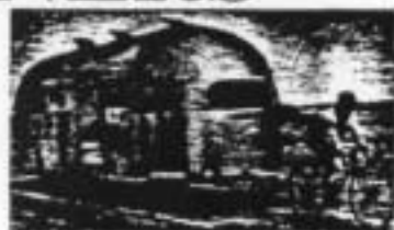
"YES, HE DID"