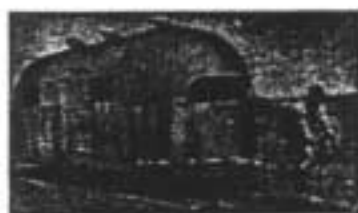
"YES, HE DID" (22 ft. overall)

WORLD'S LIGHTEST, FASTEST, EASIEST TOWING TRAILERCOACHES