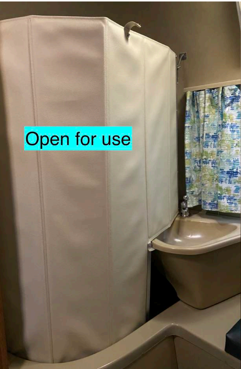
Open for use