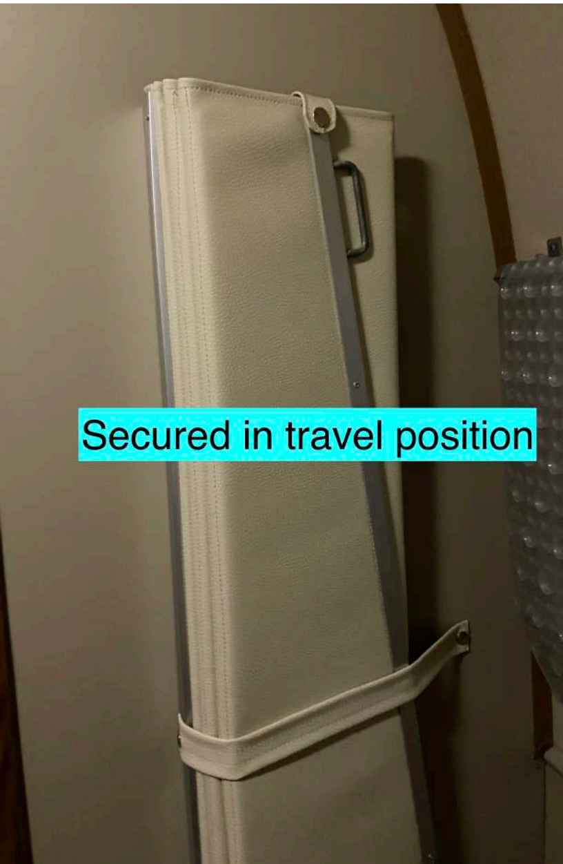
Secured in travel position