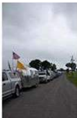
Lining up for the Vintage Parade into the International Rally, Lebanon Tennessee