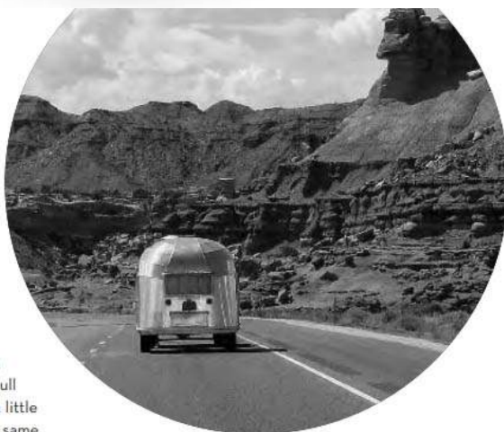
On the road in Utah, in 2011.