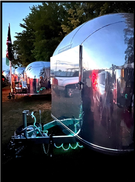
1960 International in Colorado