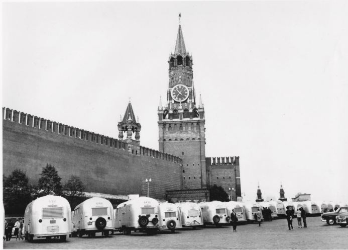
KREMLIN WALL--Travel trailers of the Wally Byam Around the World Caravan park just outside the Kremlin in Moscow during their historic overland circuit of the globe.